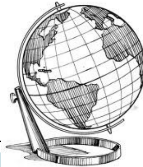
G-44 GLOBE 863

The library collaborated with Career and Technical Education to purchase new titles to support the emerging Renewable Energy Technology Program. Thanks to a generous grant, the library was able to purchase several new books and ebooks in the subject area of wind energy and renewable energy. They will be catalogued soon!